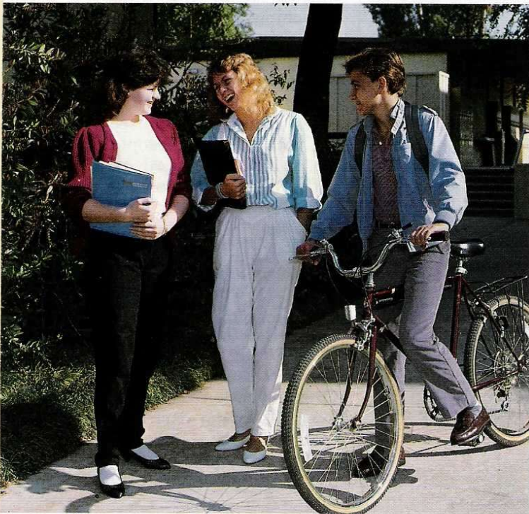
Should life be exciting and interesting only at times? Learning how to live, the purpose of human life and the secret of full, abundant, interesting, enjoyable life — this is education for life with no letdowns.

I thought I did; yet I did not know the full answer until recently. When we STOP GROWING in knowledge, we're through . I don't propose to be through yet — if keeping my mind open to new truth , when it is PROVED to be truth, will keep me going. I think I can guarantee the answer will surprise you. □