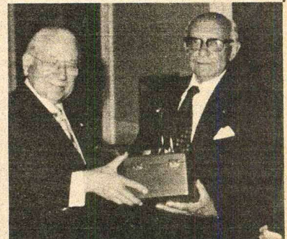
WORLD LEADERS — Herbert W. Armstrong meets with Kenyan president Jomo Kenyatta, left, and South African president Nicolaas Diederichs, right. Mr. Armstrong discusses their deaths in the above article.