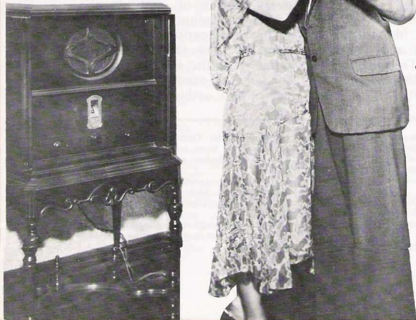
Dancing was one of many “Don'ts” to some churches in the 1920s — leading the average young person to view Christianity as a sort of living painful penance.