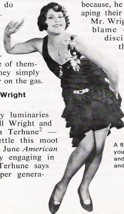
A flapper of the 1920s was a young girl "considered bold and unconventional in actions and dress."