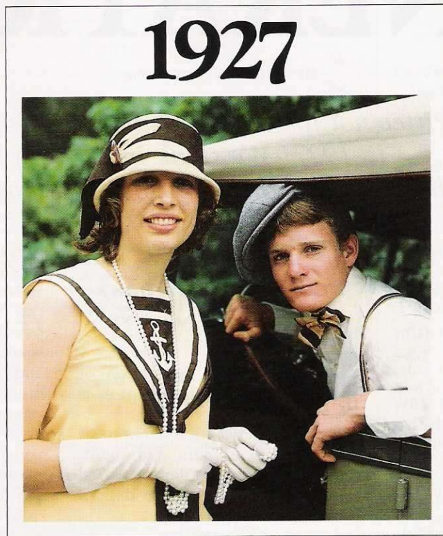
In 1927 they asked, "Is the younger generation hell-bent or not?" The debate continues in 1983.

The greatest handicap to the younger people today is their utter disregard for self-control. They have been permitted to grow up following DESIRE , instead of DUTY — given reign to impulse and inclination , instead of using