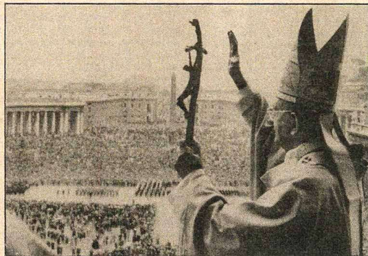
PAPAL BLESSING — Pope Paul VI imparts a blessing before crowds assembled in front of St. Peter's Basilica in Rome, Italy.

Catholic Church by launching the ecumenical movement — hoping to bring back