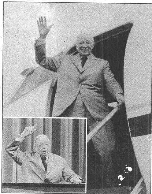
TEXAS VISIT — Herbert W. Armstrong emerges from his jet after a flight to address the Big Sandy, Tex., congregation Aug. 5 (inset).

But it is a well-ORGANIZED body. "Now there are diversities of gifts, but the same Spirit. And there are differences of administrations, but the same Lord. And there are diversities of operations, but it is the same God which worketh all in all . . . But all these worketh that one and the selfsame Spirit, divid-