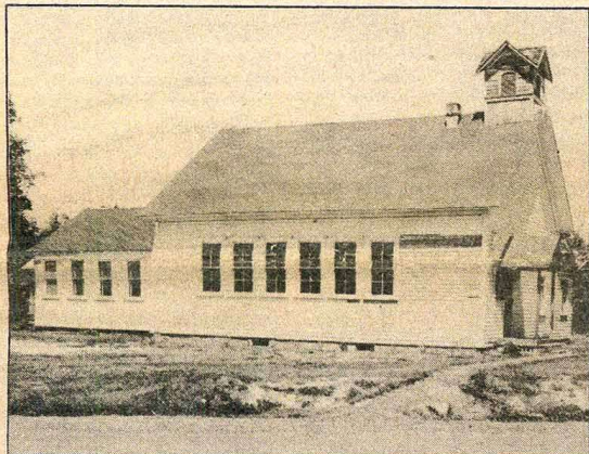
SCHOOLHOUSE — The Jean's schoolhouse near Eugene, Ore., housed the first church congregation founded by Herbert W. Armstrong as a result of a series of evangelistic campaigns in 1933.

The Old Testament sacrificial laws and ceremonial rituals were a mere temporary substitute for Christ and the Holy Spirit. When the reality came the substitute was ended, but the basic SPIRITUAL LAW — the law of LOVE codified in the Ten Commandments — continued. But the CHURCH was required, having the Holy Spirit, to obey them not (See WHY THE CHURCH, page 6)