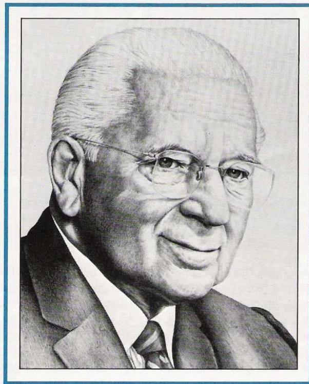
Illustration by Tom Mansanarez

Actually when I became 11, no one had ever yet flown in an airplane, and when I was born the main cities had horse-drawn “dinky” streetcars.