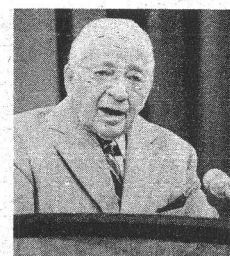
VIDEOTAPING — Herbert W. Armstrong addresses the Tucson, Ariz., church June 10 in the second of a series of videotaped sermons. These sermons will later be edited for half-hour telecasts on The World Tomorrow with Herbert W. Armstrong, as the television program is now called.

I have to say to you, in truth, that my mistake in allowing a position of authority to be inserted BETWEEN myself and the Church led to GREAT CONFUSION as to WHO IS IN CHARGE — WHO IS THE