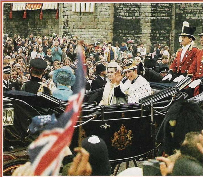
Prince Charles and his mother, Queen Elizabeth, 16 years ago at his investiture as Prince of Wales. From birth he has been training to be king.

Let's ask the Nobel prize-winner Dr. Harold Urey. He replies: "Science gives us no purpose in living beyond having a pleasant existence in one way or another." What, then, do scien-