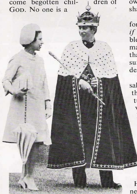
Prince Charles at age 20 received some of the symbols of rulership. Living God's way will train you to someday receive your crown.

It is ONLY those who REPENT of their transgressions of God's great spiritual law — the Ten Commandments — and who surrender to and accept as Savior JESUS CHRIST, who can become begotten children of GOD. No one is a