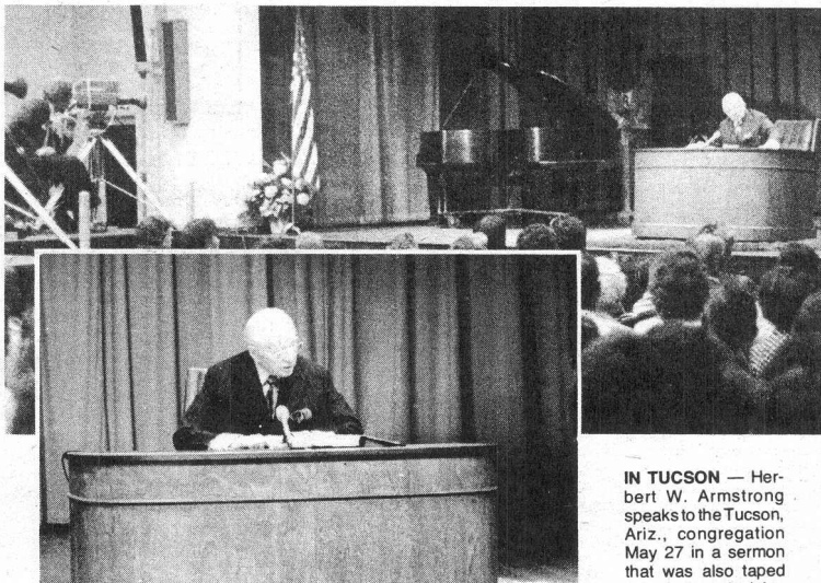
IN TUCSON — Herbert W. Armstrong speaks at the Tucson, Ariz., congregation May 27 in a sermon that was also taped for a future television broadcast. Another taping was made June 3 for the series. More tapings are scheduled.

JESUS CHRIST, through me, has now set the Church and God's WORK back on the track so that, once again, CHRIST is the living HEAD of the Church and Work!