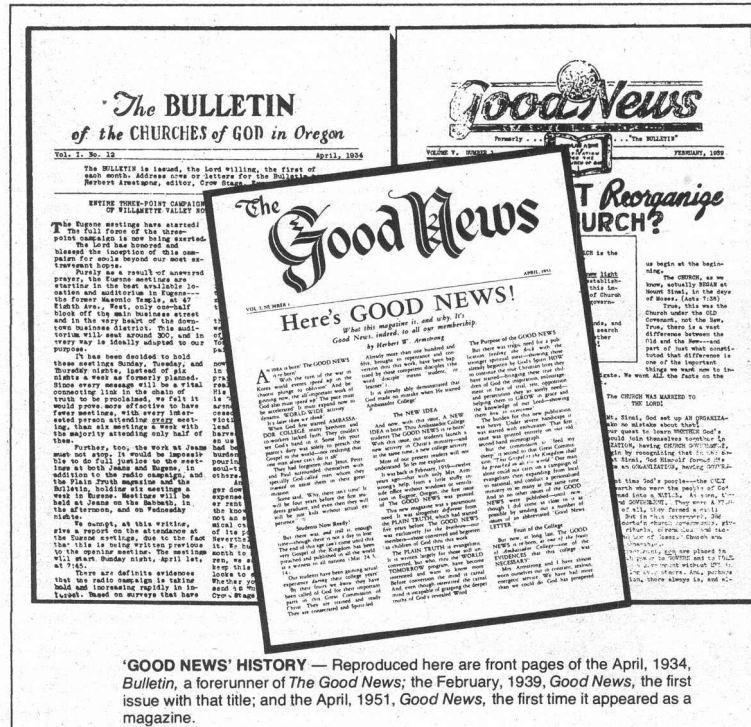
'GOOD NEWS' HISTORY — Reproduced here are front pages of the April, 1934, Bulletin , a forerunner of The Good News ; the February, 1939, Good News , the first issue with that title; and the April, 1951, Good News , the first time it appeared as a magazine.

In every way we are now putting the Work of the living God back on the track, as HE originally established it.