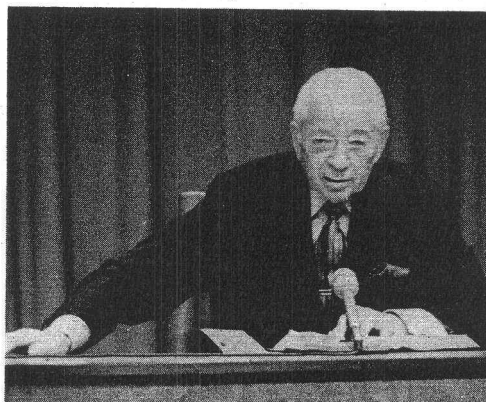
TAPED SERMON — Herbert W. Armstrong speaks to Tucson, Ariz., Church members May 27. The sermon was taped for a future television broadcast.